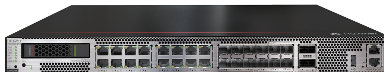
Eudemon1000E Series Firewalls (Fixed-Configuration)